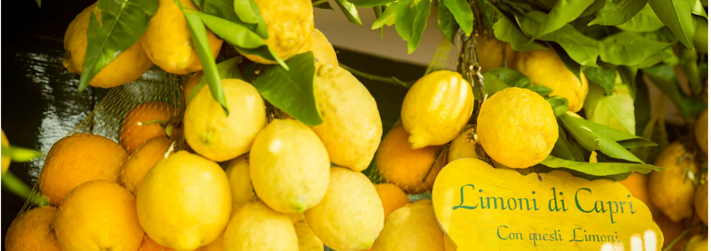
LEMONS ON CAPRI ISLAND FOR MAKING LIMONCELLO